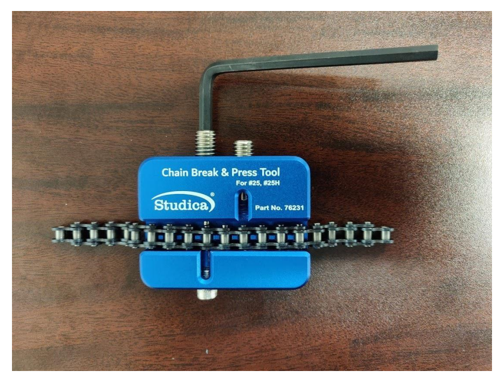
Start to screw in mandrel to remove pin.