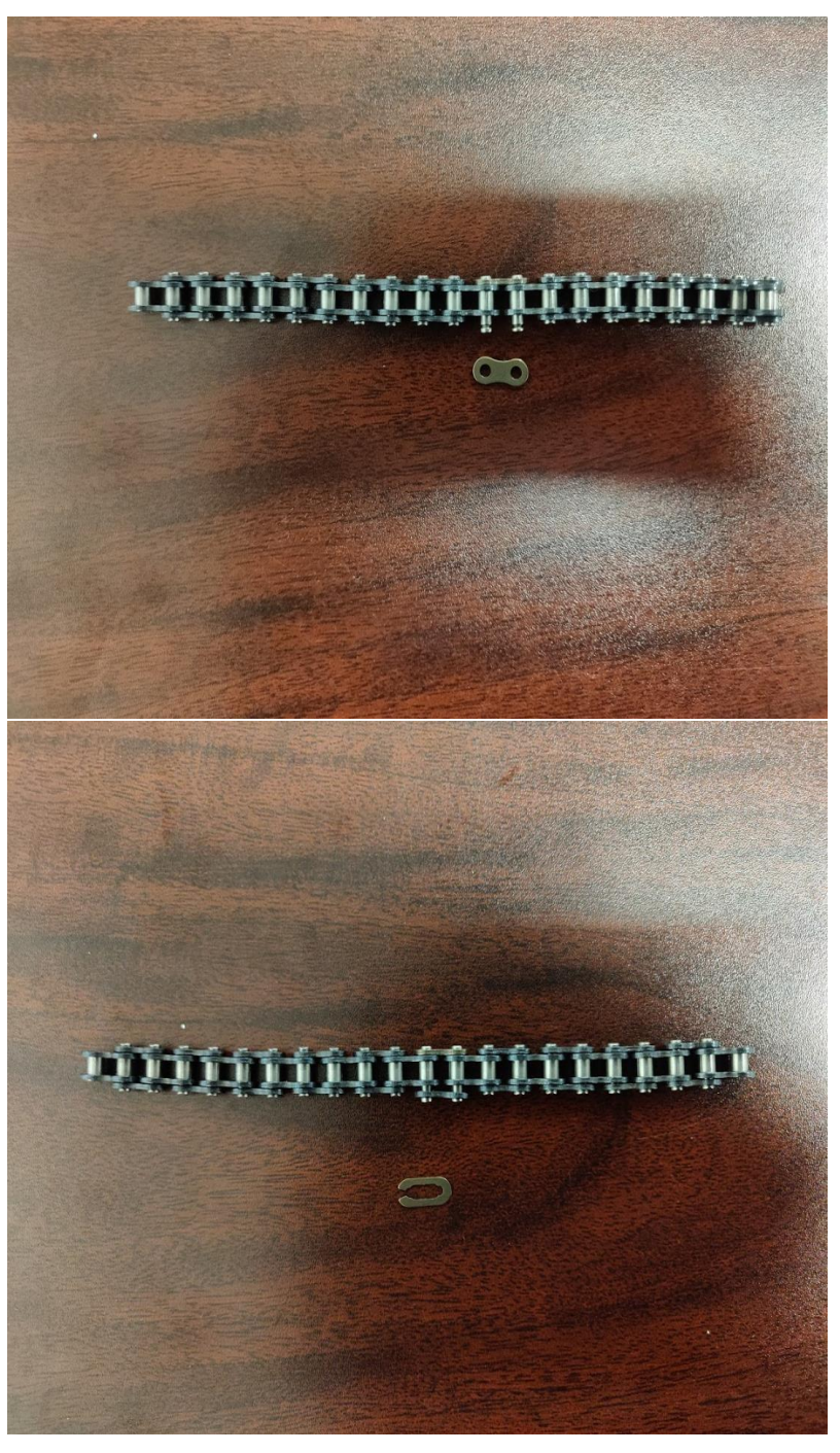
Push plate into bottom of both pins.