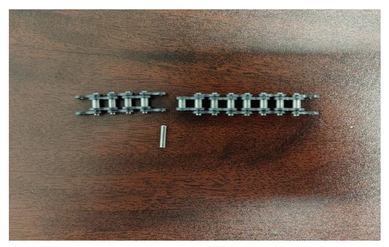
Get 2 chains and a pin ready, as pictured above.