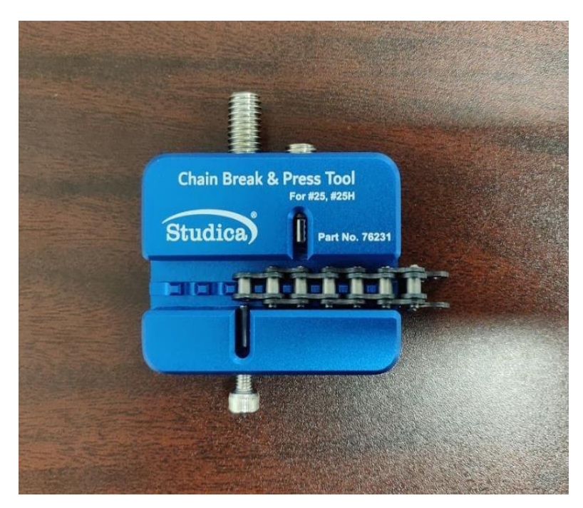
Put pin as shown above and insert first chain.