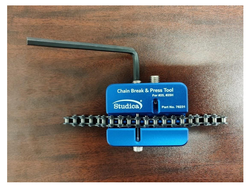
Keep screwing until pin can no longer be pushed.